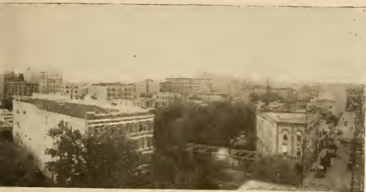
of San Antonio

apartment houses and residences have been constructed everywhere in the city. San Antonio real estate has shown a steady appreciation in value and business properties in this city offer a most stable and profitable investment, one that is certain to increase in value with the growth of the city.